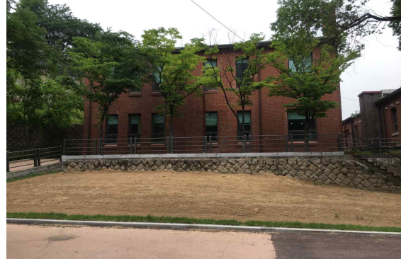
Site ②, ③(creating 2 gardens)